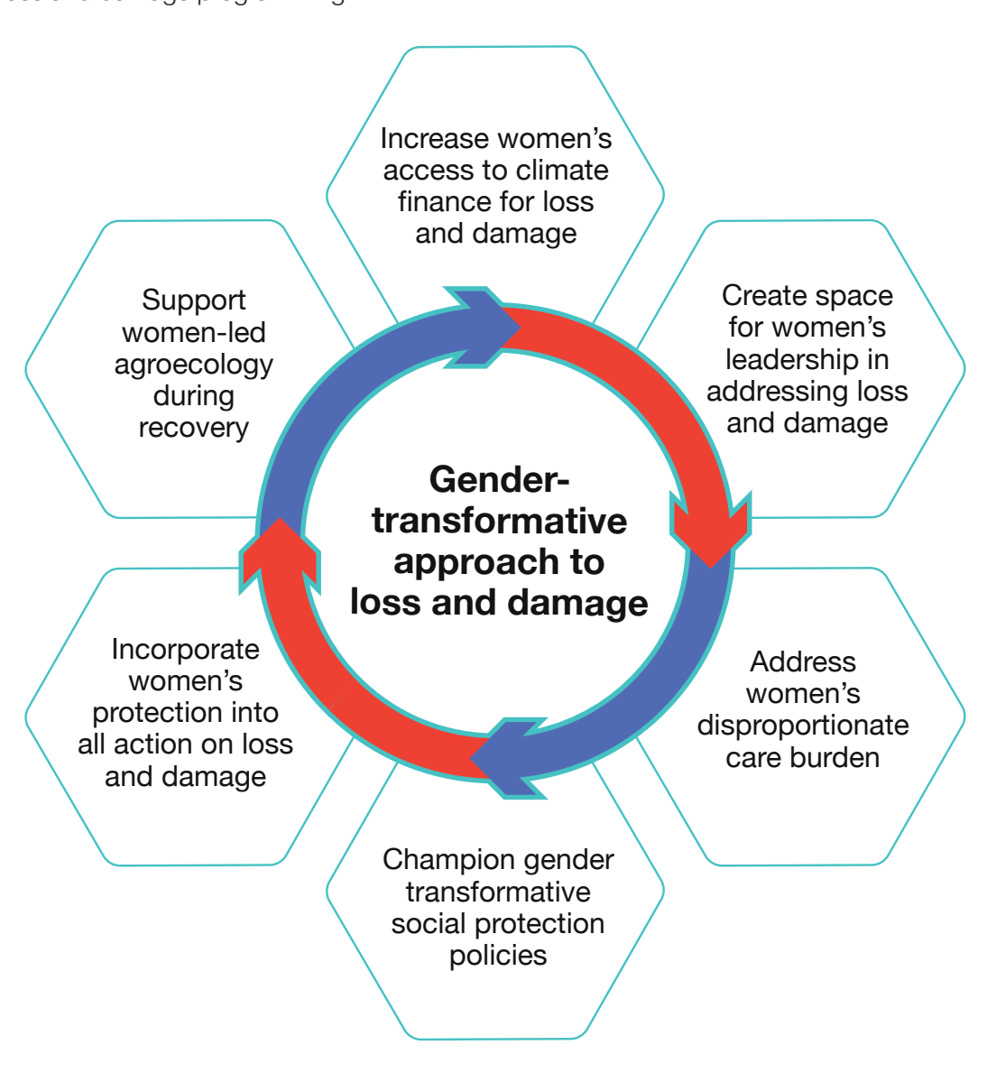
Figure 1 : Key components of a gender-transformative approach to loss and damage programming

ActionAid's research identified six key components to help guide loss and damage policy and programming in each of the four African countries involved in the research. These components should be adopted by the UK government as it considers how to address loss and damage through the FCDO, and as it contributes to international dialogues on loss and damage programming. These are illustrated in Figure 1 and detailed below.