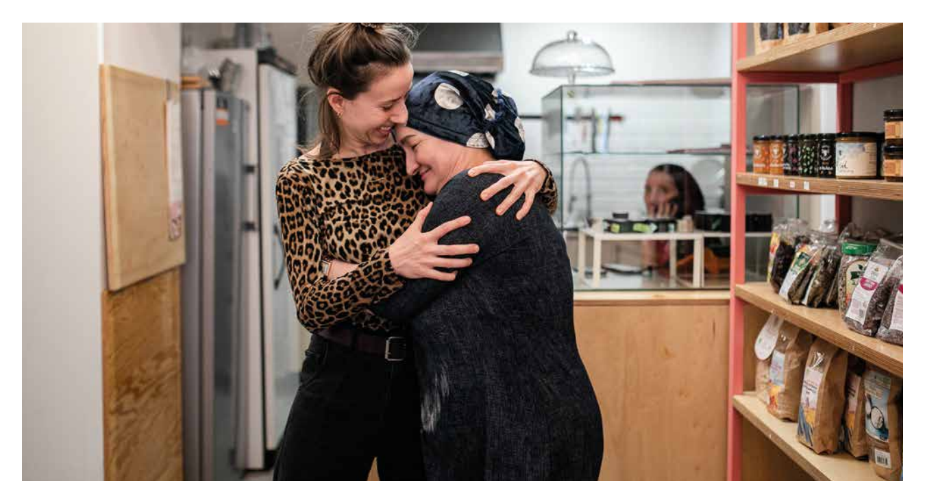
Founder and members of Kuchnia Konfliktu (Conflict Kitchen): a social initiative which aims to support refugees and migrants within Poland to find work by offering fair terms of employment and training, while also working to break down stereotypes.