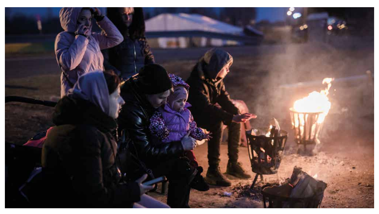
Zosin crossing point on the Polish Ukraine border Where ActionAid partners PAH (Polish Humanitarian Action) are operating.

Despite these challenges, women, WROs and WLOs are at the frontline of caring responsibilities in households as well as leading national and local civil society organisations, emergency protection and assistance services. Their work aims to advance and defend gender equality and women's rights, through WROs and WLOs, and young people-led organisations and initiatives. Their longterm mandates include addressing discrimination, providing sustainable and dignified livelihoods, and protecting women's rights. This work is essential to upholding women's rights while military priorities dominate Ukraine and the region. ActionAid and partner's evidence and experience highlight that WROs and WLOs bring valuable skills and assets to localised humanitarian action. They are often able to gain access to hard-to-reach communities and those most marginalised within them, they bring a strong understanding of the local context and the needs and realities of women, girls and the community as a whole, and they