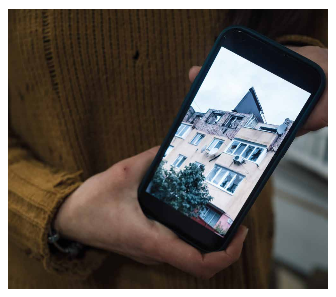
Natalia, a volunteer at Insight NGO, shows a video with her destroyed apartment on the top floor of the building in Irpin.