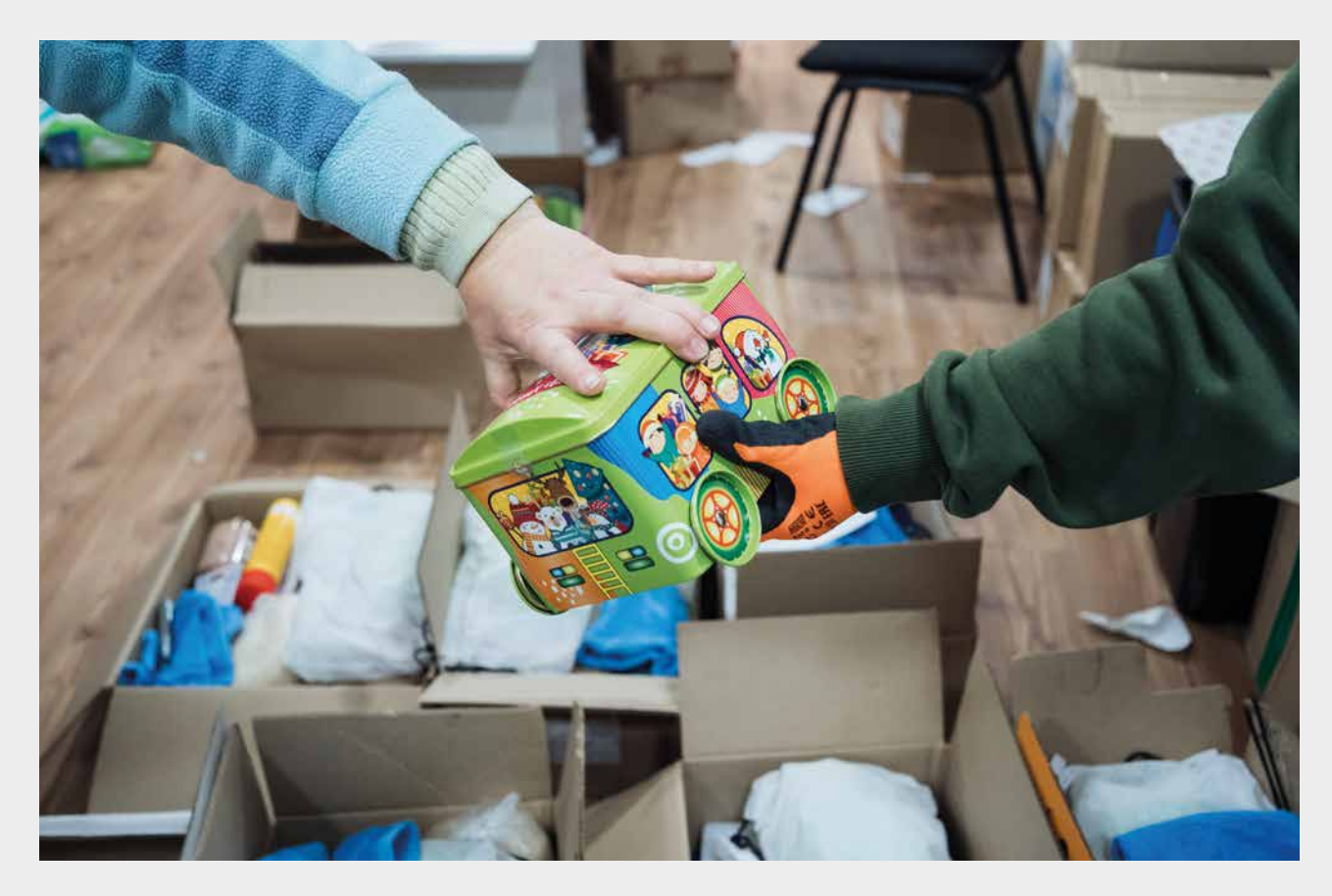
Children and women's dignity kit packages at Insight humanitarian Hub, Ukraine (Anastasia Vlasova/ActionAid).