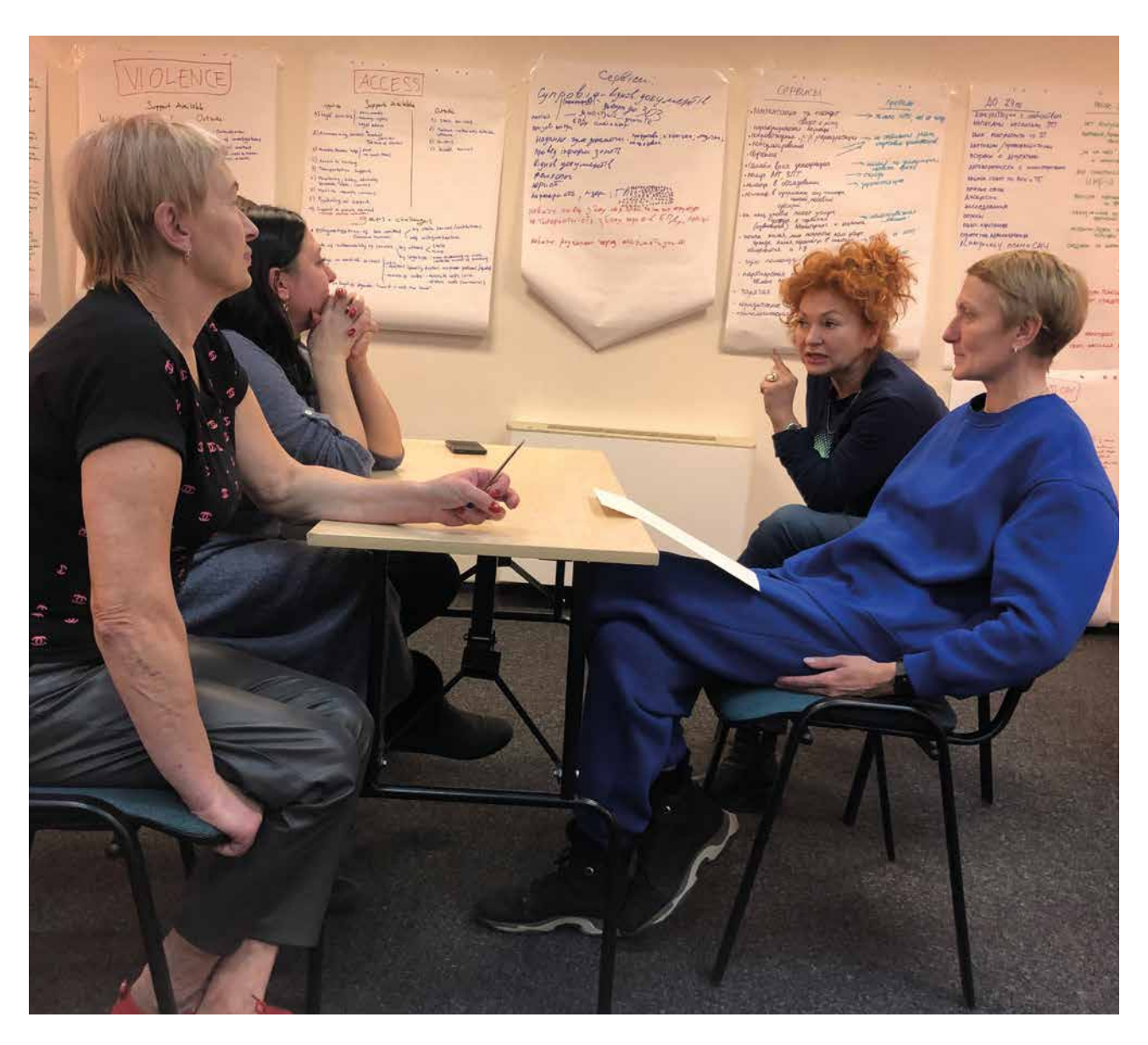
Legalife partner in Ukraine country at a research workshop with ActionAid, addressing key lessons learnt and challenges faced. This workshop took place in an underground shelter, amidst ongoing air strikes in Ukraine. (Jara Henar/ActionAid).