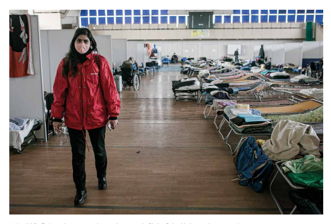
ActionAid Staff pictured at sports and recreation center in Chelm, Poland being used as a reception centre (Simona Supino/ActionAid).

This loss in livelihoods, combined with increased rent, energy, and electricity prices in Ukraine and unequal access to finance, resources, and services, is making more difficult for women to access safe and dignified accommodation. Within Ukraine, around two thirds of the population displaced by the war live with relatives, friends, or in rented housing.61 Ukraine's neighbouring countries have hosted the people escaping the war in Ukraine through a combination of government-run and privately-run shelters and individual private homes offered by citizens of the host country.62 Temporary accommodation run by private providers and strangers do not always provide a dignified space for living, have much more limited services and assistance - such as psychosocial support, registration, medical support, and case management - and increase the protection risks for women and girls when they rely on unvetted individuals.