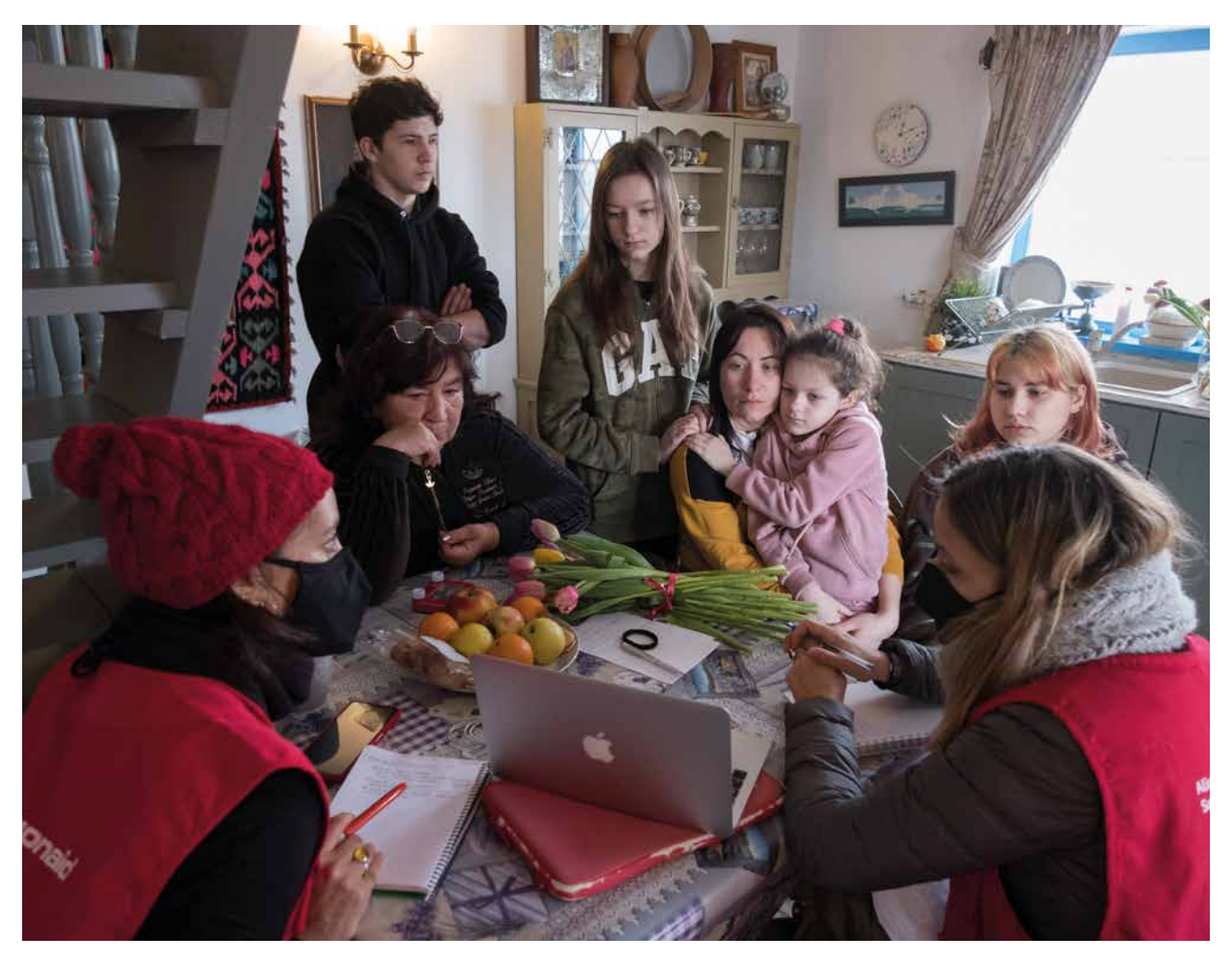
Ukrainian Refugee Family who fled the war as their city was under threat of being bombed speaking to ActionAid staff. They took four buses, a ferry and crossed from Isaccea, the southernmost border of the Romanian-Ukrainian border.

Analysing converging axes of oppression that compound wulnerability for women of diverse backgrounds (e.g race, class, disability, SOGI) and applying this information to ensure effective targeting and accessible services and support.