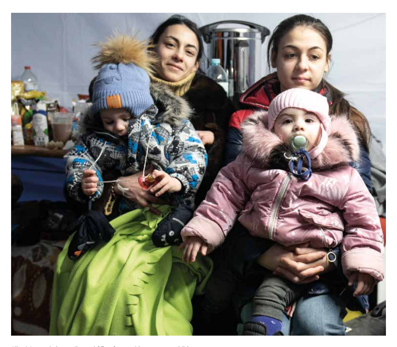
Alina* (named changed), aged 27, refugee with two young children (ActionAid UK).