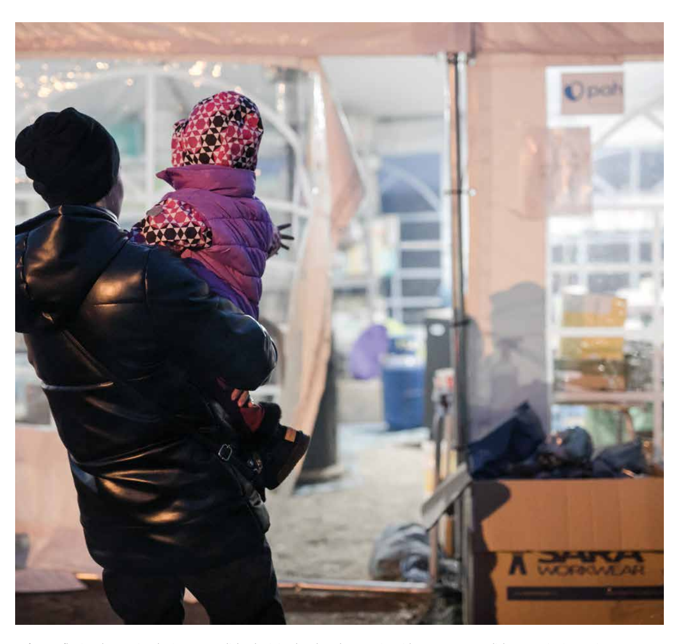
Refugees fleeing the war in Ukraine, at a Polish-Ukrainian border where ActionAid partner PAH (Polish Humanitarian Action) was operating.

Each section presents first the context, and then the main challenges that partners are facing, followed by specific examples of their adaptive and responsive strategies. All three topics are interconnected, and bring to the forefront the importance of holding equitable partnerships and funding streams. The final section describes overarching recommendations in these three areas.