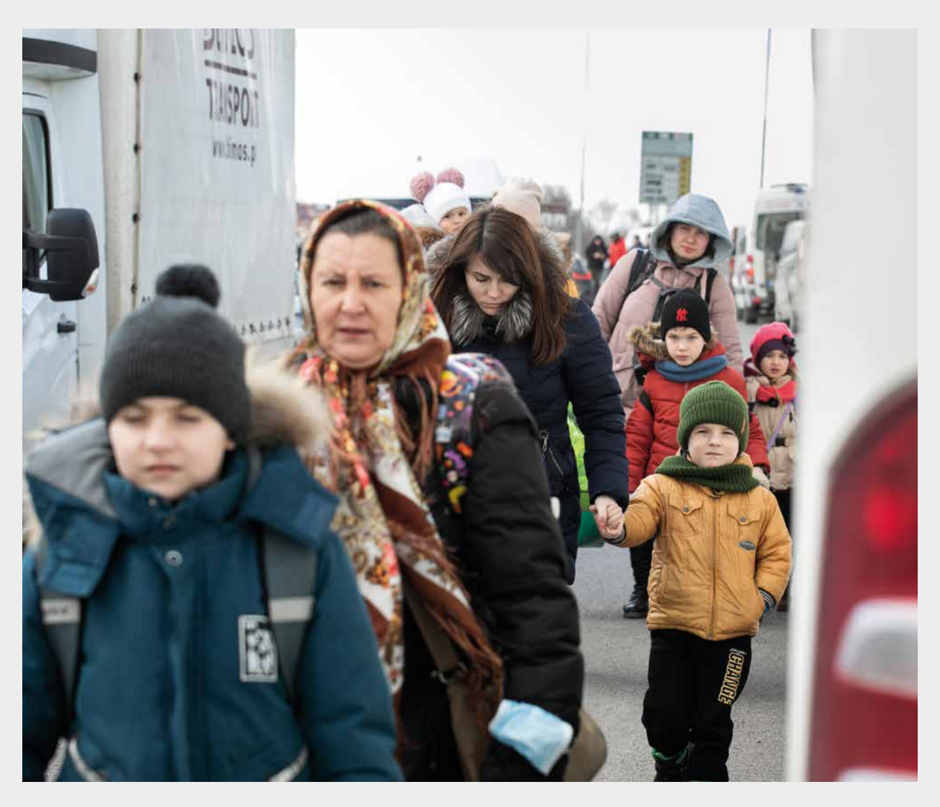
Displaced women and children arrive at Hrebenne, a crossing point on the Polish side of the Ukraine-Poland border where ActionAid and partner PAH were working (Simona Supino/ActionAid).